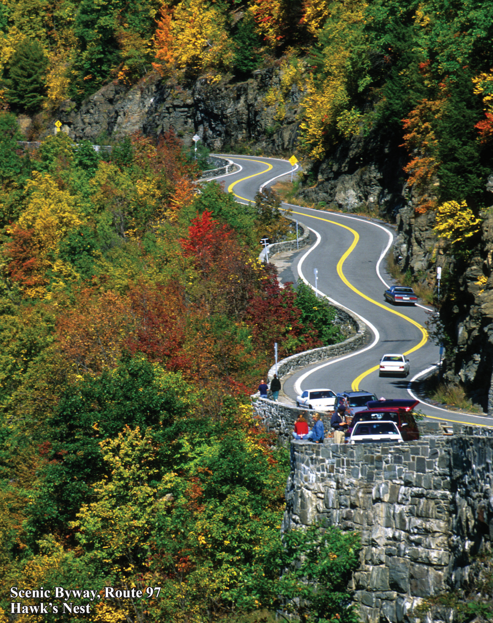
Scenic Byway, Route 97 Hawk's Nest